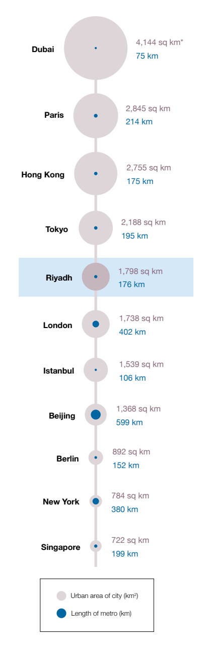
FIGURE 2 Global ranking by metro length to urban area

*Note: Represents the area of the Emirate of Dubai