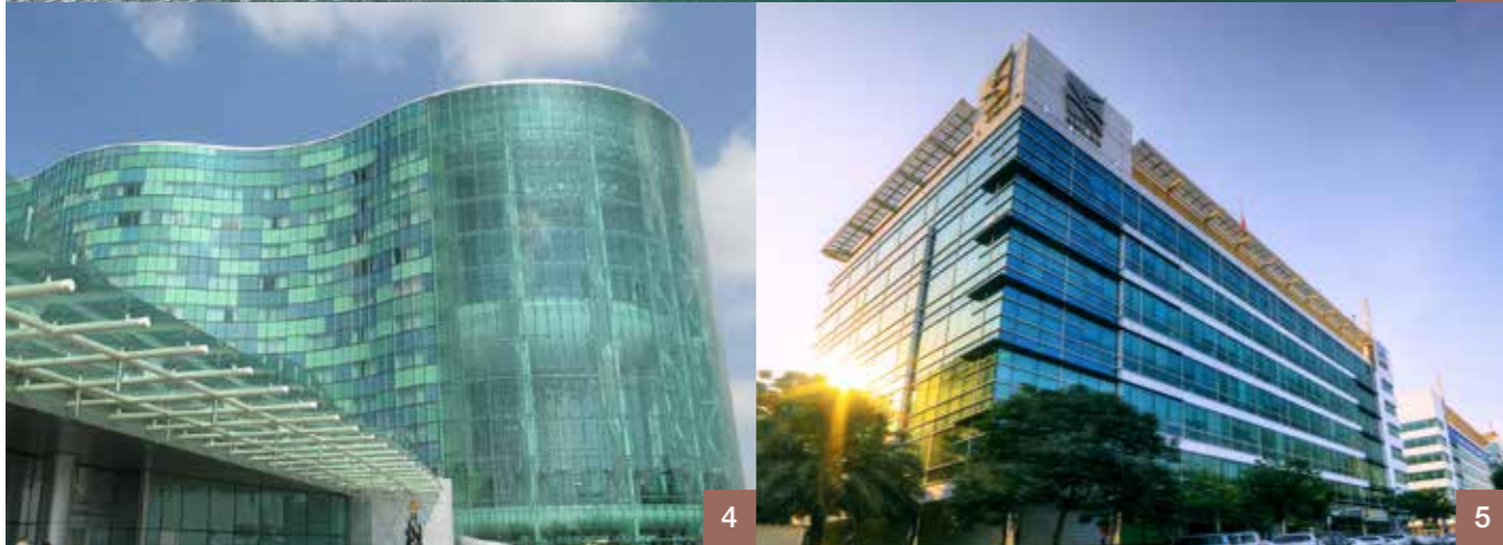
5 Emaar Business Park Dubai, UAE Retail advisory, consultancy and transactional leasing