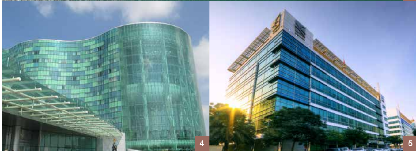
4 Bridgeway Mall Abu Dhabi, UAE Retail advisory, consultancy and transactional leasing