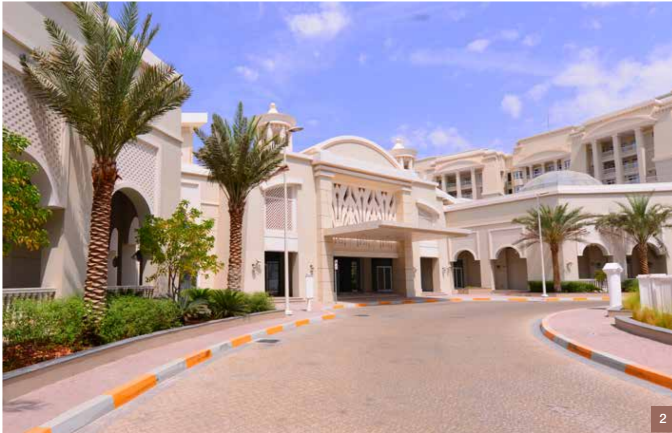
2 Al Forsan Village Abu Dhabi, UAE Retail advisory, consultancy and transactional leasing