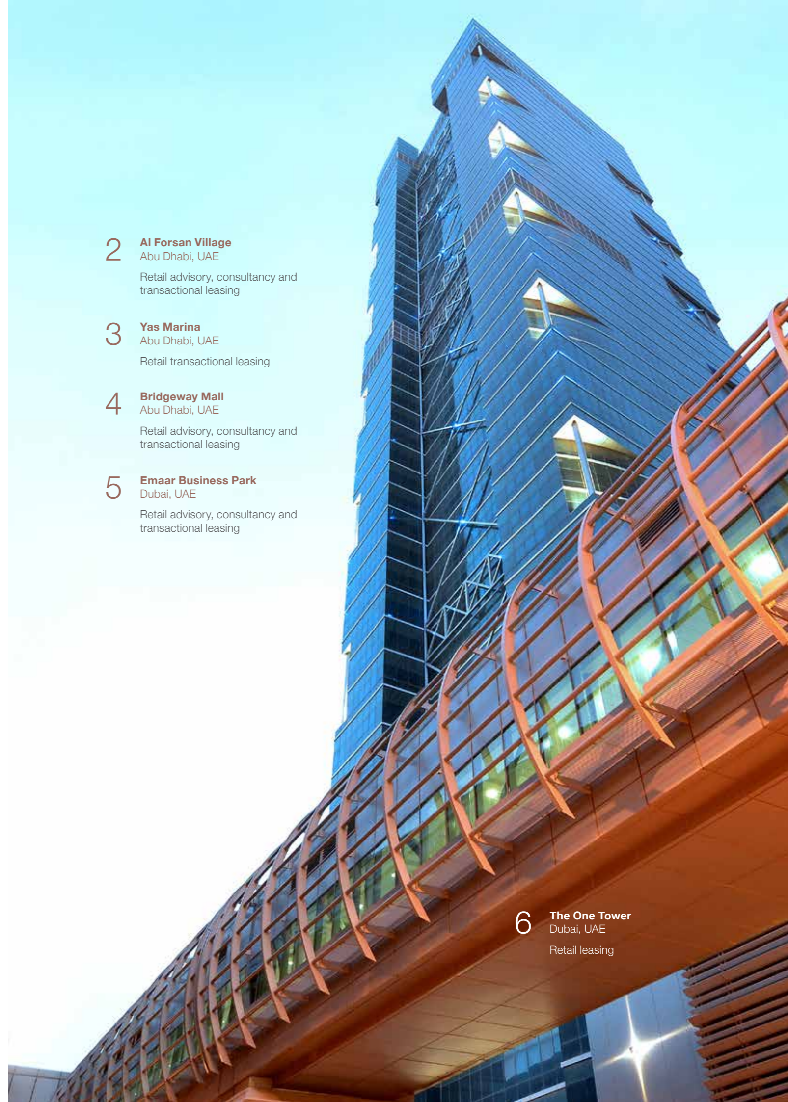
6 The One Tower Dubai, UAE Retail leasing