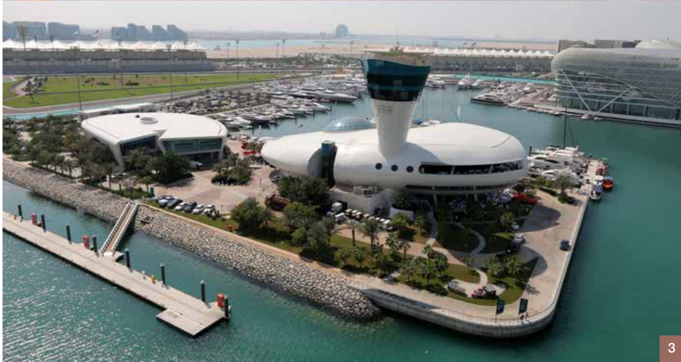
3 Yas Marina Abu Dhabi, UAE Retail transactional leasing